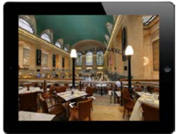
Tour business interiors with Google Business Photos on desktop, mobile, and tablet devices